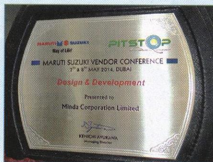
The 'Design & Development Award' won by Minda Corporation and Minda SAI from Maruti Suzuki India

Quality assuring activities start from supplier's quality system development to receipt of final products by the customers. To ensure these, the